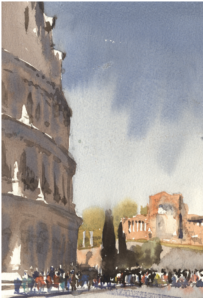
(LEFT) In the Shade of the Coliseum, Rome , Stewart White, 2016, watercolor, 10 x 7 in., private collection, plein air