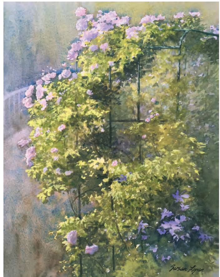
(TOP) Morning Run, Chateau de Bonnemare , Sergey Pietilä, 2020, pastel, 23 3/5 x 47 1/5 in., available from artist, plein air • (LEFT) Vine Ripened , Poppy Balser, 2020, oil, 16 x 12 in., available from artist, plein air • (ABOVE) Cascading Roses , Susan Lynn, 2017, watercolor, 14 x 11 in., collection the artist, plein air