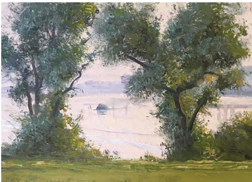
(CLOCKWISE FROM TOP LEFT) White Roses , Camille Przewodek, 2012, oil, 14 x 11 in., private collection, plein air • Garden Party , Lori Putnam, 2018, oil, 36 x 48 in., The Irvine Museum, UCI, permanent collection, studio from plein air study • Bright White , Nancie King Mertz, 2020, pastel, 11 x 14 in., available from Art De Triumph, plein air • Plein Greens , Mark Shasha, 2019, oil, 9 x 12 in., available from artist, plein air