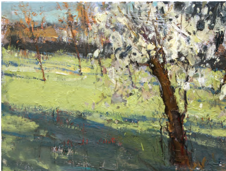
Pear Blossoms , Anton Pavlenko, 2019, oil, 18 x 24 in., available from Peterson Contemporary Gallery, plein air