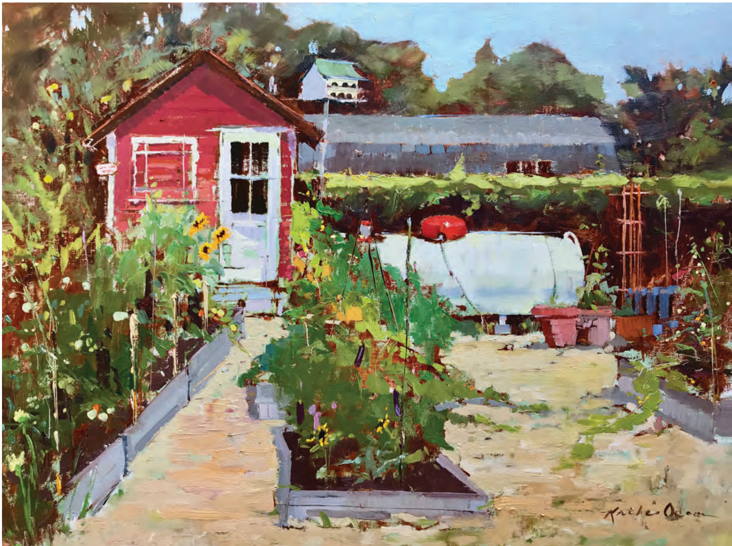
Raise 'Em Up Right Kathie Odom 2019, oil, 18 x 24 in. Available from The District Gallery, Knoxville, TN Plein air