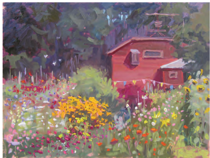
Mille Fiori , Manon Sander, 2017, oil, 11 x 14 in., private collection, plein air