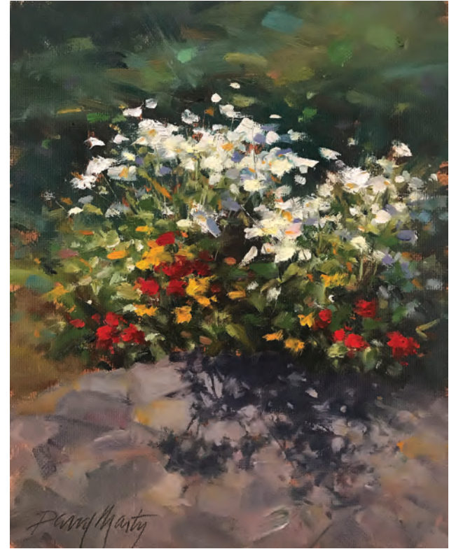
Summer Flowers and Shadows , David Marty, 2020, oil, 10 x 8 in., available from artist, plein air