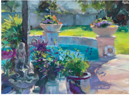
Garden Sanctuary Krystal W. Brown 2020, oil, 16 x 20 in. Available from artist Plein air