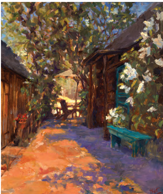
Timeless Scents Karen Ann Hitt 2019, oil, 12 x 10 in. Private collection Plein air and studio