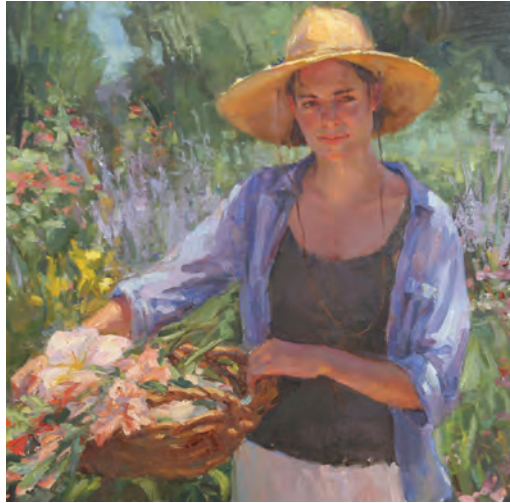
Summer Garden , Carolyn Lindsey, 2011, oil, 24 x 30 in., private collection, studio from plein air study