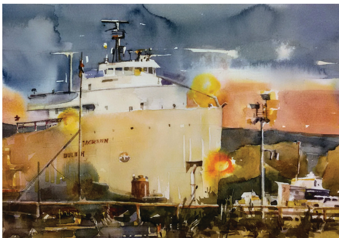
Duluth at Night Francesco Fontana 2016, watercolor, 10 x 12 in. Collection the artist Plein air