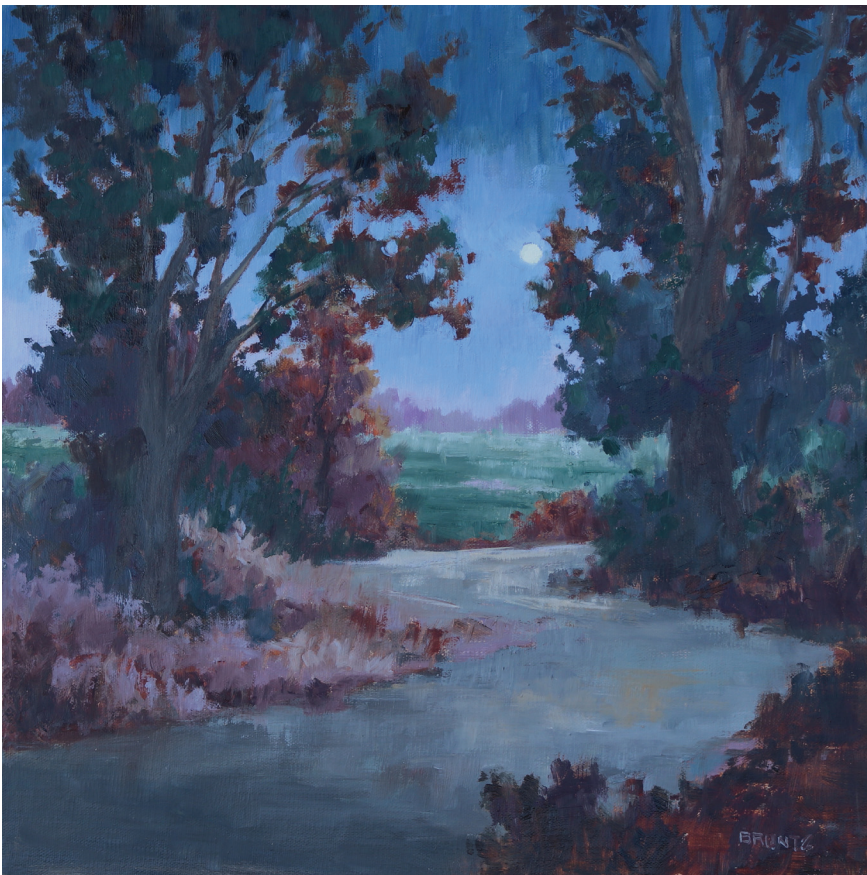
Moonlit Drive Beverly Bruntz 2017, 12 x 12 in. Collection the artist Plein air

An increasing number of nocturnal paintings are being included in plein air competitions, in part because the artists enjoy the challenge of working in the dark and in part because the novelty attracts patrons to plein air festivals. Observers who become buyers are attracted to the painted records of the mysterious and fascinating play of lights. Here is how several plein air painters handled that challenge. 📺