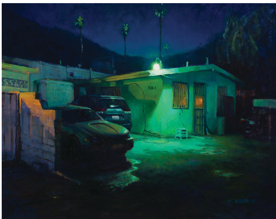
Behind the Massage Parlor Carl Bretzke 2017, oil on linen, 22 x 28 in. Private collection Plein air