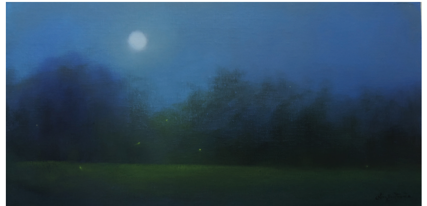
Blue Moon Fireflies Lisa Eastman 2017, oil on panel, 10 x 20 in. Collection the artist Plein air

"Nocturnes are a bit more challenging," says Californian Beverly Bruntz. "As with any painting, the unexpected usually happens, but that's what make plein air painting so fun. When painting at dusk or during the night, I prepare a few things ahead of time, like premixing some dark blues, greens, and purples. I usually start developing the initial composition/block-in while at the site when there is still some daylight, and as darkness sets in I use a HUGlight around my neck to see the palette and canvas. I also keep a flashlight handy for backup."