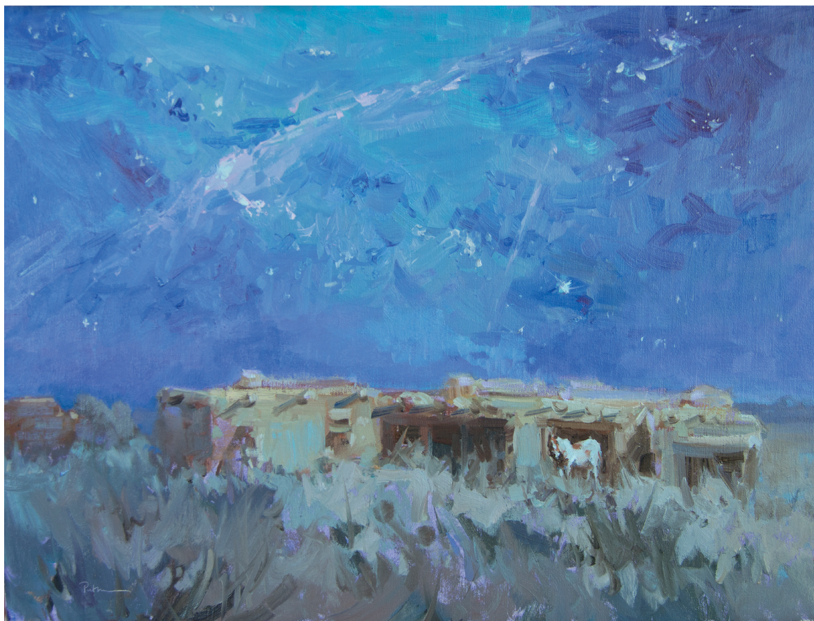
Night Watch Lori Putnam 2016, oil on linen, 18 x 24 in. Collection the artist Studio