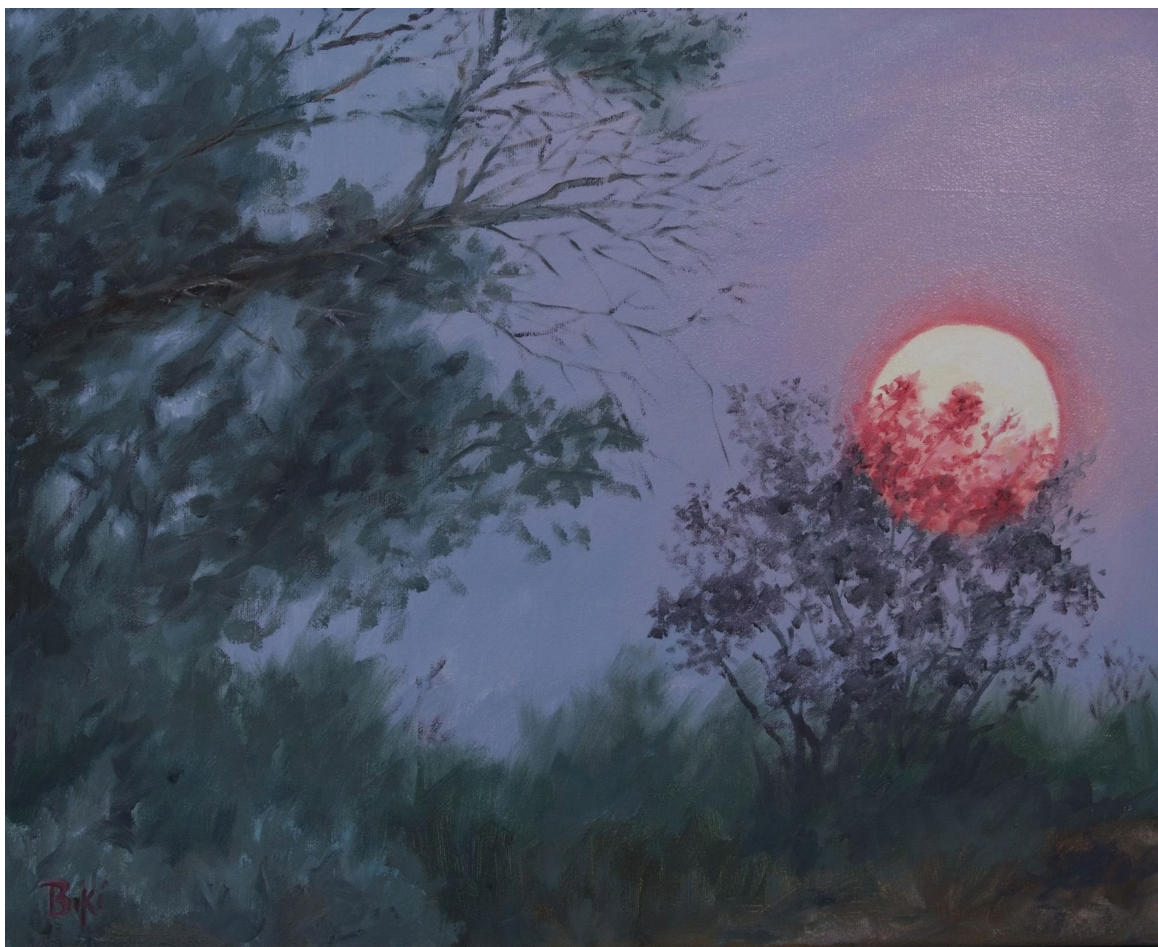
Full Moon Rising Biki Chaplain 2017, oil on canvas, 16 x 20 in. Collection the artist Plein air