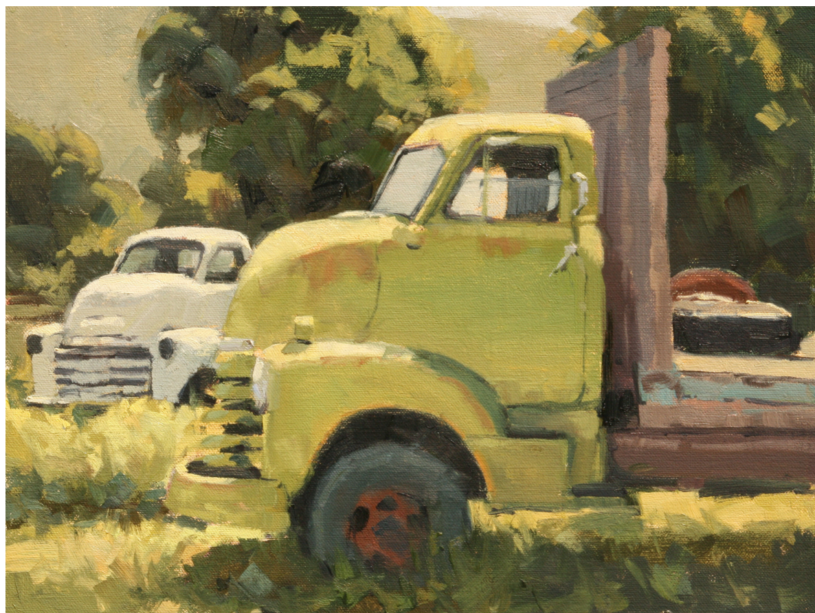
Green Truck Kate Starling 2016, oil, 12 x 16 in. Collection the artist Plein air