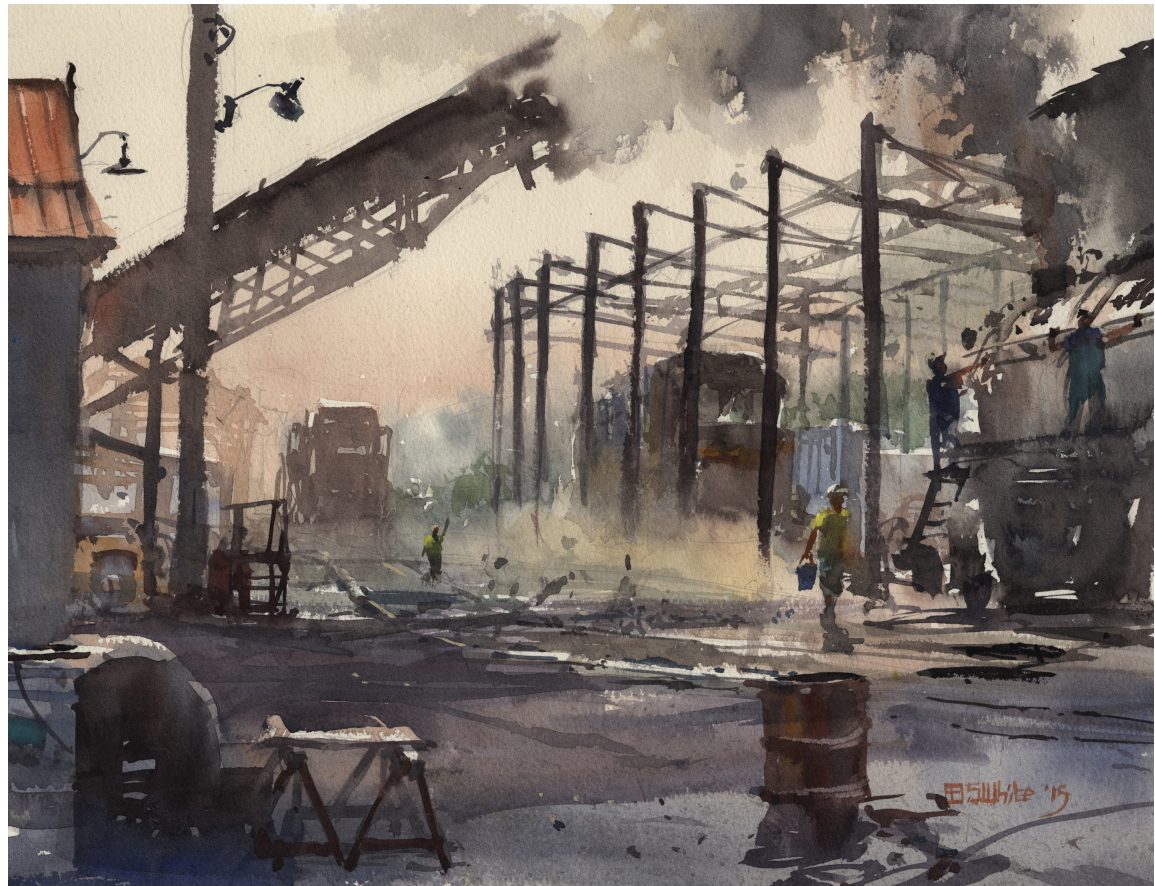
All Steamed Up Stewart White 2015, watercolor, 12 x 15 in. Private collection Plein air

Teresa Dong 2016, oil, 16 x 20 in. Collection the artist Studio