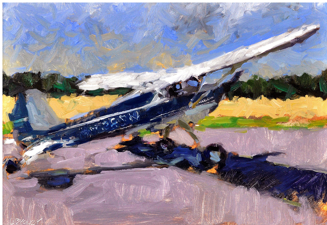
Sky Watcher Lon Brauer 2016, oil, 16 x 12 in. Collection the artist Plein air