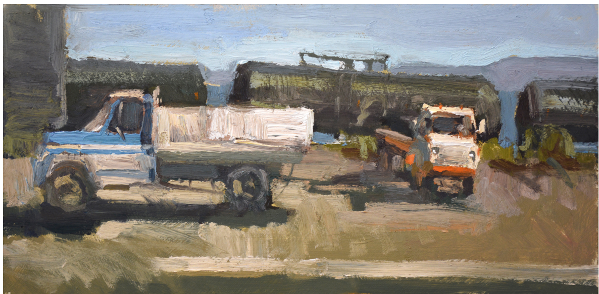
At Kelly Bean Silas Thompson 2016, oil, 8 x 16 in. Collection the artist Plein air

Tim Horn 2014, oil, 16 x 20 in. Private collection Plein air