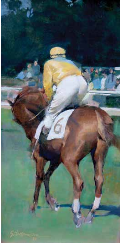
(LEFT) BURTON SILVERMAN (b. 1928), The Workout , 1997, oil on canvas, 17 x 12 in., private collection ■ (RIGHT) DANIEL SPRICK (b. 1953), Snow Rider , 2018, oil on canvas, 30 x 16 in., available from the artist ■ (BELOW LEFT) SHANDY STAAB (b. 1984), Everyday Treasures , 2020, oil on linen, 22 x 22 in., available from the artist ■ (BELOW RIGHT) DIANE FROSSARD (b. 1962), The Greeting , 2017, oil on panel, 12 x 12 in., private collection