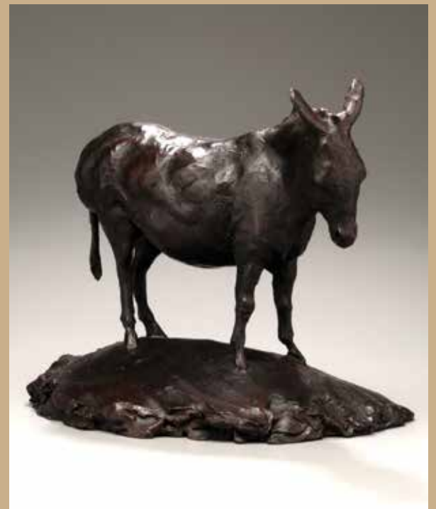
(TOP LEFT) ABIGAIL GUTTING (b. 1990), The Beast , 2020, oil on linen, 20 x 16 in., McLarry Fine Art, Santa Fe ■ (TOP RIGHT) DAN KNEPPER (b. 1961), Black Horse and a Cherry Tree , 2020, oil on canvas, 12 x 16 in., Vision Gallery, Morehead City, North Carolina ■ (ABOVE) JOSHUA KOFFMAN (b. 1972), Compañero , 2011, bronze (edition of 9), 10 x 13 x 9 in., FAN Gallery, Philadelphia ■ (LEFT) ALEXA KING (b. 1952), Barbaro , 2009, bronze, 1 1/2 life-size, installed at Churchill Downs, Louisville