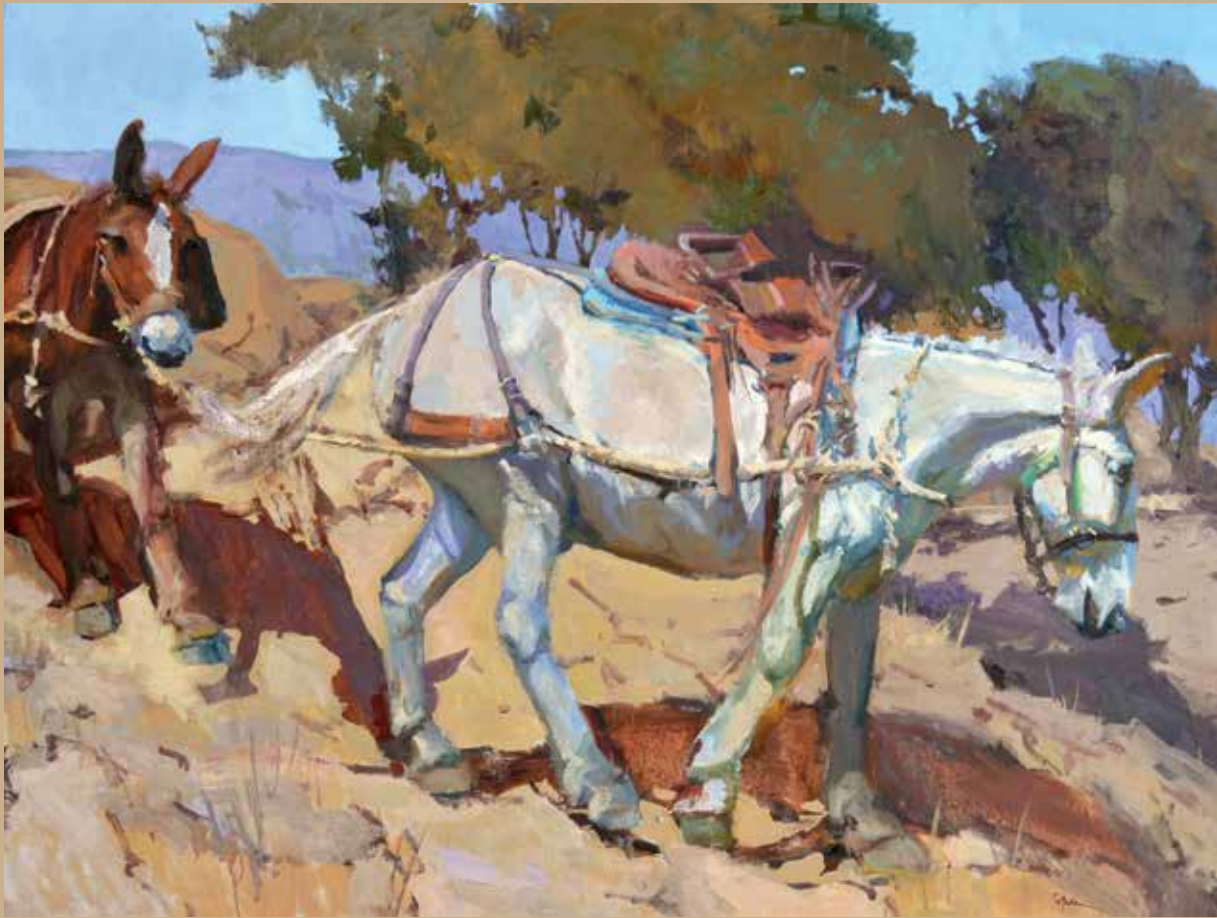
LORI PUTNAM (b. 1962), Headin' Home , 2020, oil on linen on panel, 36 x 48 in., available from the artist