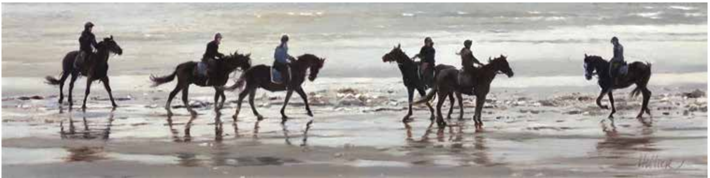
(TOP ROW) JULIET. CHAPMAN (b. 1963), Blue Waltz , 2019, mixed media on panel, 24 x 36 in., Montana Trails Gallery, Bozeman, Montana ■ MARK GLEASON (b. 1962), Spitfire , 2019, oil on canvas, 30 x 30 in., available from the artist ■ (MIDDLE ROW) ROX CORBETT (b. 1956), My Girl , 2015, charcoal on paper, 20 1/2 x 28 1/2 in., First Place in Two- Dimensional Paper at Cowgirl Up! , Desert Caballeros Western Museum, Wickenburg, Arizona, now available from the artist ■ GIANNI STRINO (b. 1953), The Force of Nature , 2020, oil on canvas, 16 x 16 in., Lotton Gallery, Chicago ■ (ABOVE) MATTHEW HILLIER (b. 1958), Turning Back , 2017, oil on board, 9 x 26 in., private collection