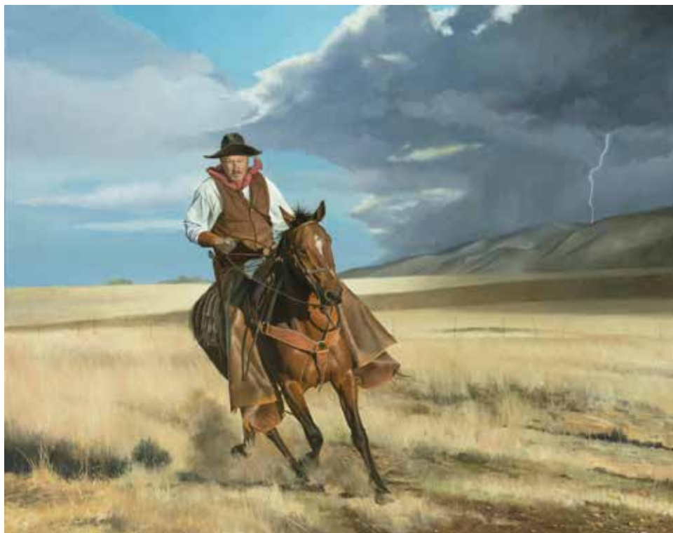
LEE ALBAN (b. 1948), Ahead of the Storm , 2019, oil on panel, 24 x 30 in., available from the artist

Artists today are just as inspired by horses as their predecessors were. Illustrated here are recent images that capture horses in various modes: racing, riding, hunting, galloping, hauling, pasturing, and resting. (We have even illustrated a donkey to remind everyone of the horse's oft-overlooked cousin.) The artists represented here are sustaining mankind's timeless love of a unique creature that will — literally — never go out of style. ●